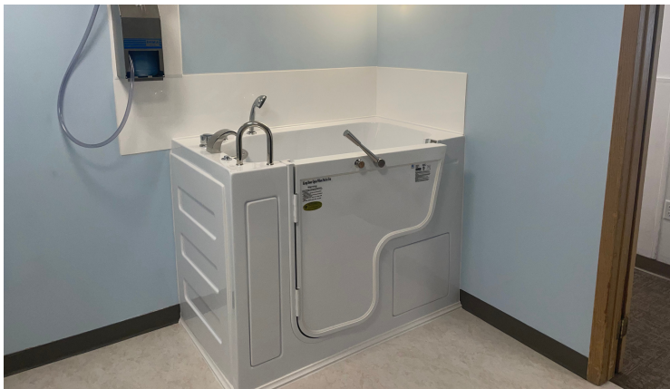
New bathtub in the large bathroom