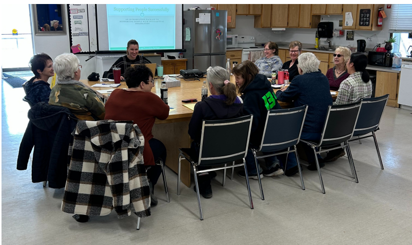
Staff training in-service at IPI

We are looking forward to continuing the fun at the day program!