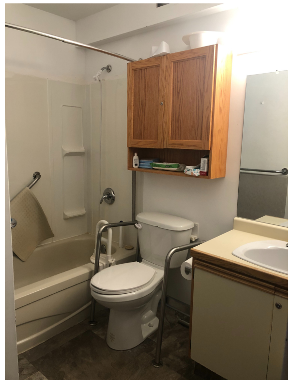
Small Bathroom, needed updates

Thank you to SARGAN for the 2022/23 flow through funding, which allowed many large projects to be completed!