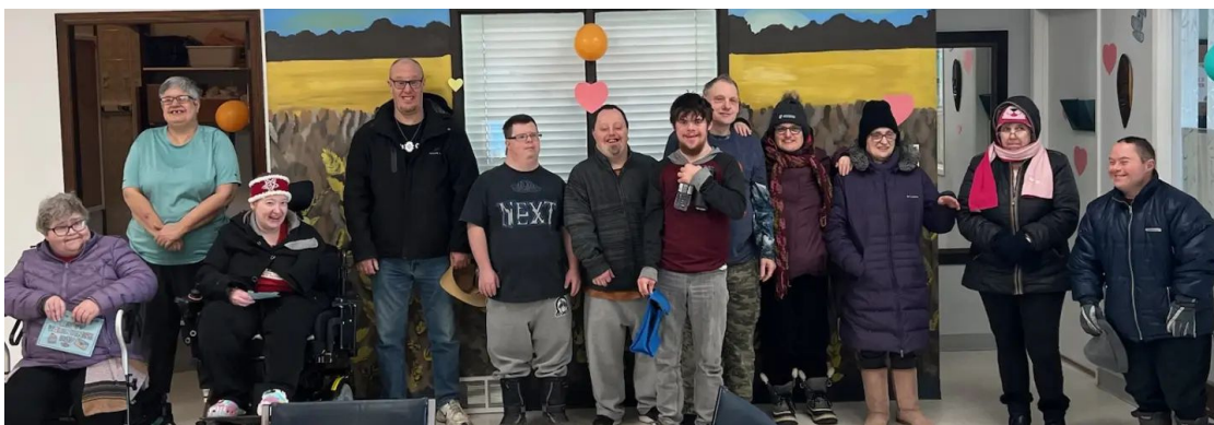
Moose Jaw Diversified Services came out to IPI for a Valentine's Day Party. We were so excited to see new and old friends!