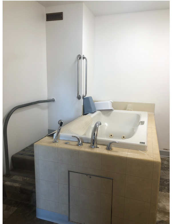
Large Bathroom- old tub was a safety concern