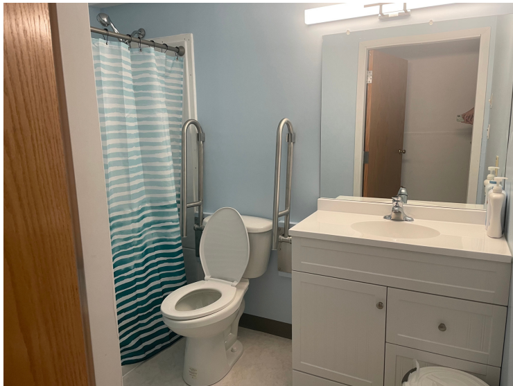
Newly renovated small bathroom

Thank you to the Ministry of Social Services for providing funding to renovate the bathrooms at IPI. The new bathrooms are wonderful!